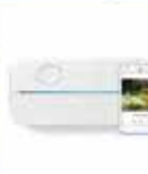
Radio Smart Irrigation Controller