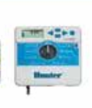
Hunter X-Core Smart Irrigation Controller