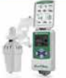
RainBird Wireless Rain Sensor