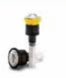
RainBird HE-VAN/ RVAN Nozzles