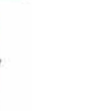
RainBird Pressure Regulated Sprinklers