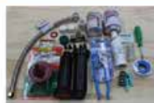
Indoor/Outdoor Leak Repair Kit