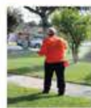
Landscape Assessment & Irrigation Survey