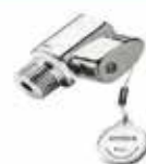
Evolve Shower Start