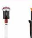
HunterMP Rotator Sprinkler Nozzles