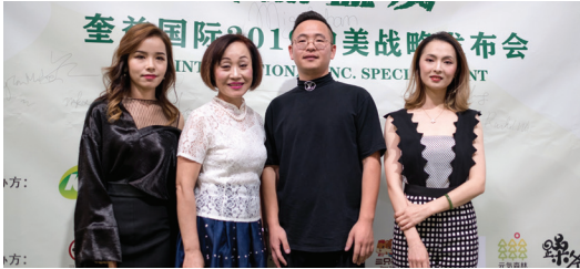
Miss Su Wangxiulan mayor of Walnut City attending the conference