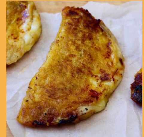
Plantain empanadas, Don Carlos Pupuseria, South El Monte