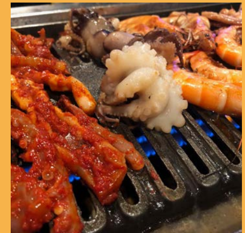
Korean barbecued seafood, RH BBQ, Rowland Heights