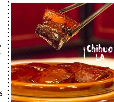
隆興記 Longxing Ji 140 W Valley Blvd Ste 211, San Gabriel CA 91776 (626) 307-1188