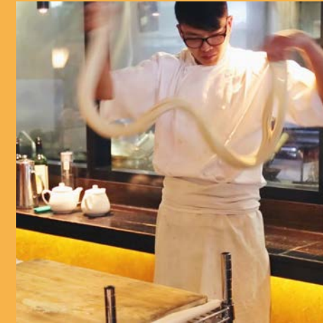
Hand-pulled lamian noodles, Northern Cafe, Temple City