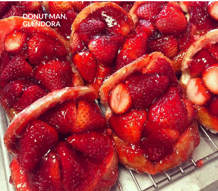
DONUT MAN, GLENDDORA

A drive-through donut bakery. What's not to love? 15300 Amar Rd, La Puente, CA 91744 (626) 968-2912