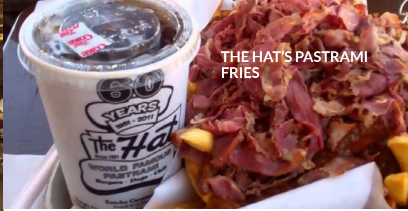
THE HAT'S PASTRAMI FRIES