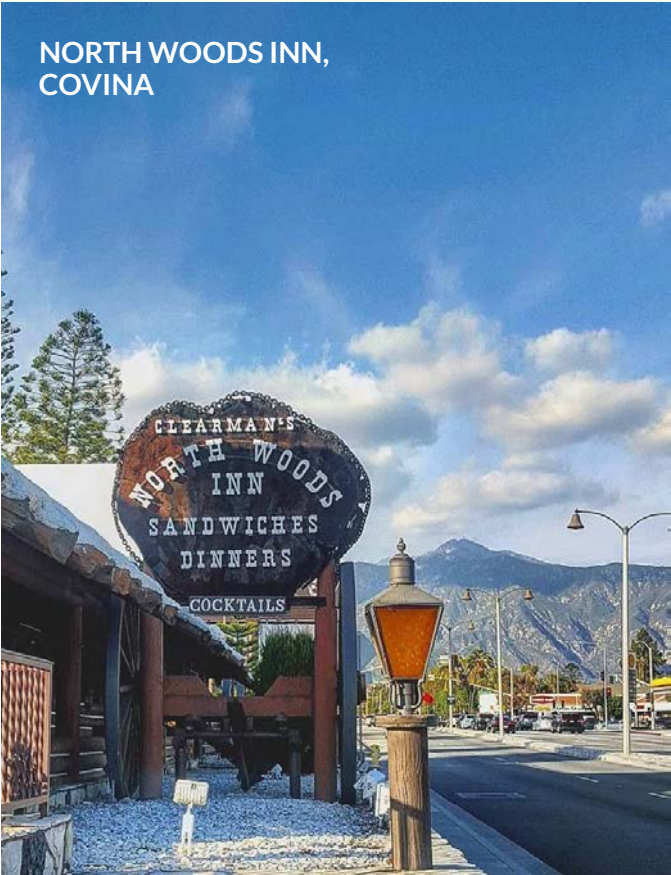
NORTH WOODS INN, COVINA