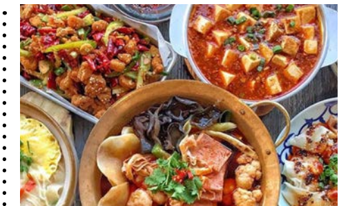
錦城裡 Sichuan Impression 1900 W. Valley Blvd, Alhambra CA 91803 (626) 283-4622

Sichuanese cuisine has bold flavours, with pungent spiciness from a liberal use of garlic and chili peppers, as well as the unique flavour of the "numbing" Sichuan pepper. There are many local variations from Sichuan Province and its neighbour, Chongqing.