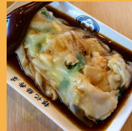
Chang fen (rice noodle rolls) & milk tea, Yin Ji Chang Fen, San Gabriel*