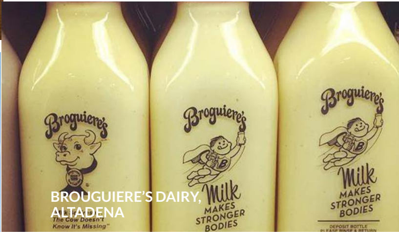
BROGUIERE'S DAIRY, ALTADENA