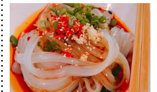
成都映像 Chengdu Impression 21 Huntington Dr, Arcadia CA 91006 (626) 462-9999