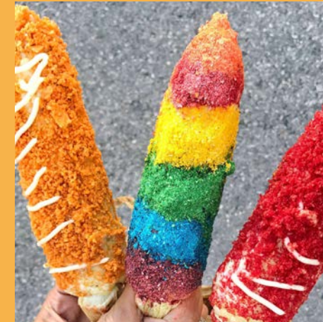
Rainbow Elotes, 626 Night Market, Arcadia

The SGV is known for top-notch cuisine from around the world - but we also offer some quirky treats and lesser-known specialties.