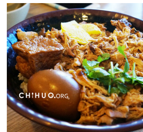
印地安啤酒屋 Uncle Yu's Indian Theme Restaurant 633 S. San Gabriel Blvd, San Gabriel CA 91776 (626) 287-0688