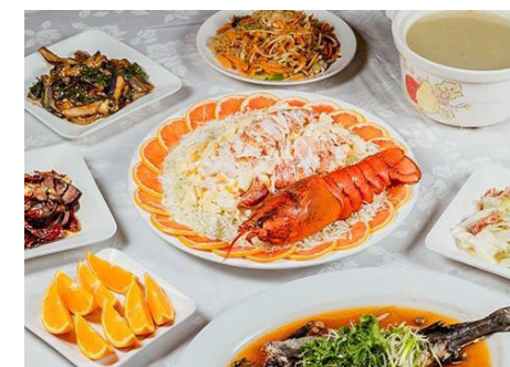
辛巴樂 Simbala Restaurant 510 E Live Oak Ave, Arcadia CA 91006 (626) 581-9885