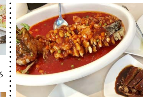
Shanghaiander Palace 1440 S. Baldwin Ave, Arcadia CA 91007 1695 S. Azusa Ave, Hacienda Heights CA 91745 (626) 348-8866