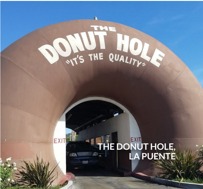
THE DONUT HOLE, LA PUENTE