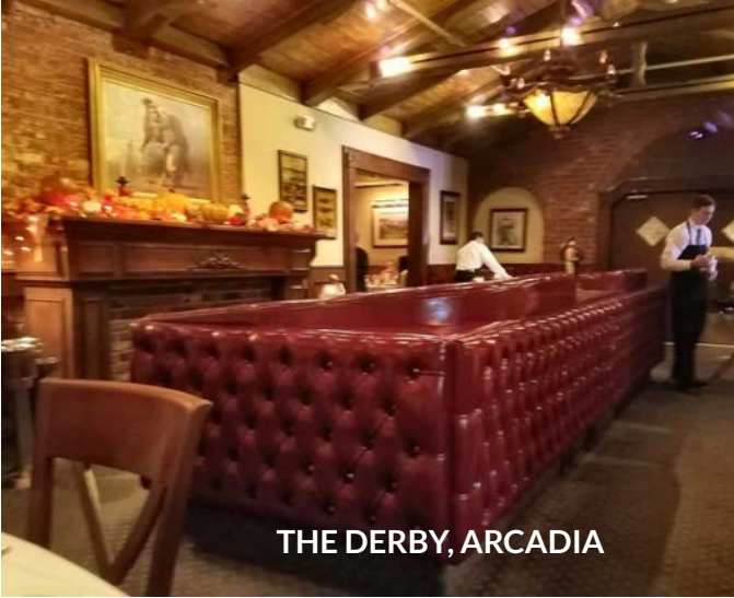
THE DERBY, ARCADIA