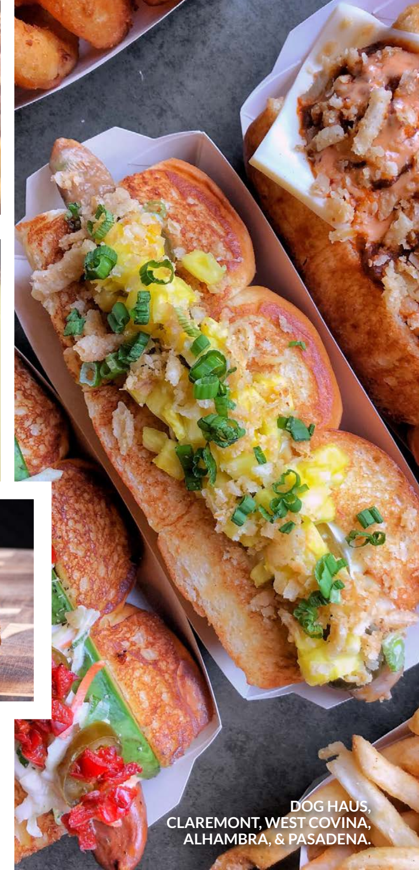
DOG HAUS, CLAREMONT, WEST COVINA, ALHAMBRA, & PASADENA.

If you can finish one pastrami sandwich on your own, you are a champion. Locations across L.A., including Alhambra, Temple City, Glendora, Pasadena, and Monterey Park.