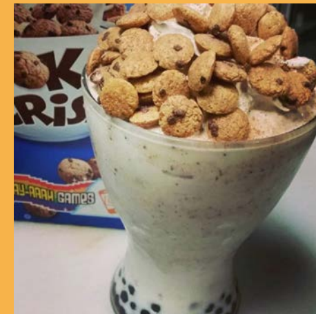
Cereal Milk Shake with Boba Pearls, Boba Tea Lounge, Covina