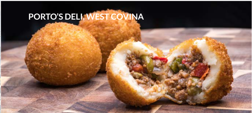
PORTO'S DELI, WEST COVINA