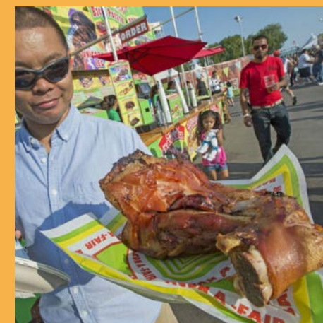
Bacon-wrapped unicorn leg, L.A. County Fair, Pomona