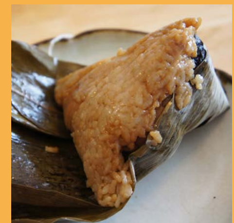
Fresh zongzi, Dim Sum King, El Monte