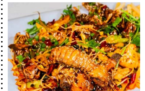
滋味成都 Chengdu Taste 8526 W. Valley Blvd, Suite 108-109, Rosemead CA 91770 (626) 899-8886 828 W. Valley Blvd, Alhambra, CA 91803 (626) 588-2284 18406 E. Colima Rd. Suite A, Rowland Heights CA 91748